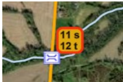
11 s = 11-ton limit for single axle 12 t = 12-ton limit for tandem axle

Mobile Mapping Bridge Limits Agencies recently requested a way to flag bridges with weight restrictions. Several ideas were discussed but the winning idea is a blue & white bridge icon on the map with an orange placard displaying the weight limit or height restriction. This icon becomes visible at a 5-mile zoom level and is a default feature of the “Fire CAD Map” or “Fire CAD Map with Aerial” themes. If you use another map theme, you can manually add the “Bridges” layer from the Operational Layers section. Four bridges (2 in Deerfield and 2 in Hamilton Twp) use the FAST Act EV Limits (EV = Emergency Vehicle).