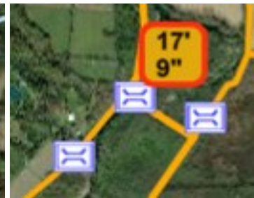
A bridge with height restriction of 17' 9"